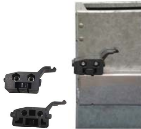
Image shown out of vehicle for clarity.

Note orientation of drawer stops “arm” faces rear of vehicle and nylock nuts inserted in drawer stops face outwards away from drawer body to engage 6mm bolts.